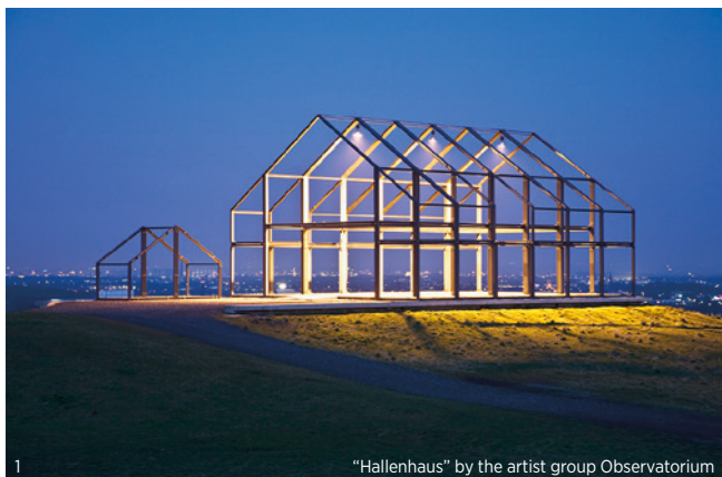
"Hallenhaus" by the artist group Observatorium